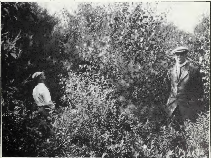
FIG. 2.—WHITE PINE SAPLINGS ENDANGERED BY GRAY BIRCH AND IN NEED OF A DISENGAGEMENT CUTTING.